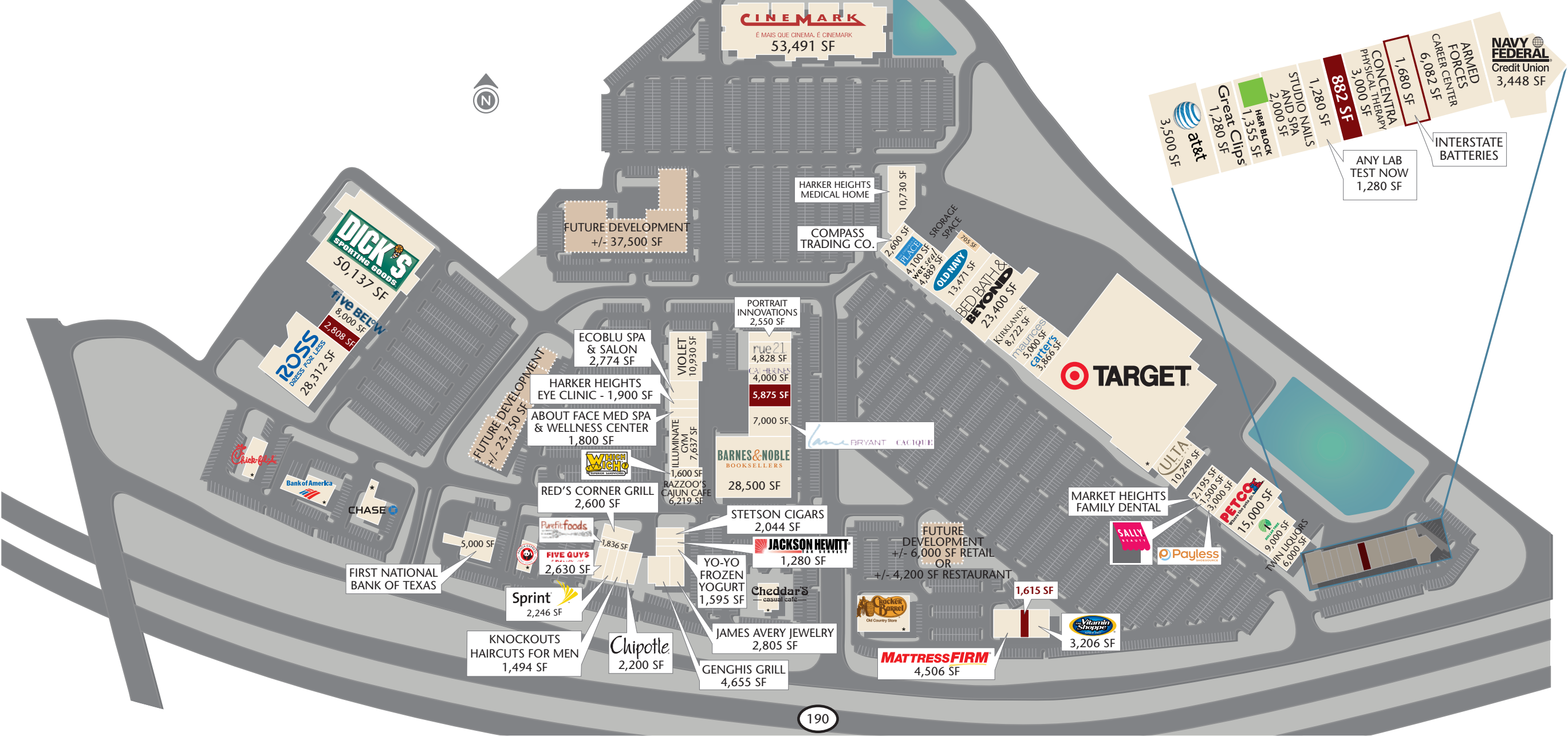
Property Lineup and Square Footage